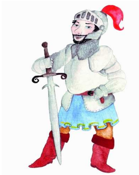
brave – horse – man – Round Table