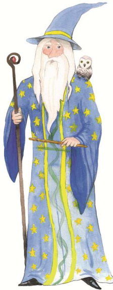
wizard – King Arthur – owl – wand

Work with a partner. Describe the picture on your card. Your partner draws the picture! Then, change roles.